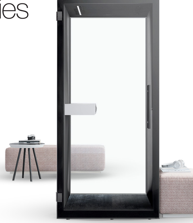
Superior soundproofing with dB rating of 34