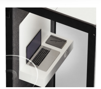
Supplied with shelf and power outlet with UK plug and USB as standard